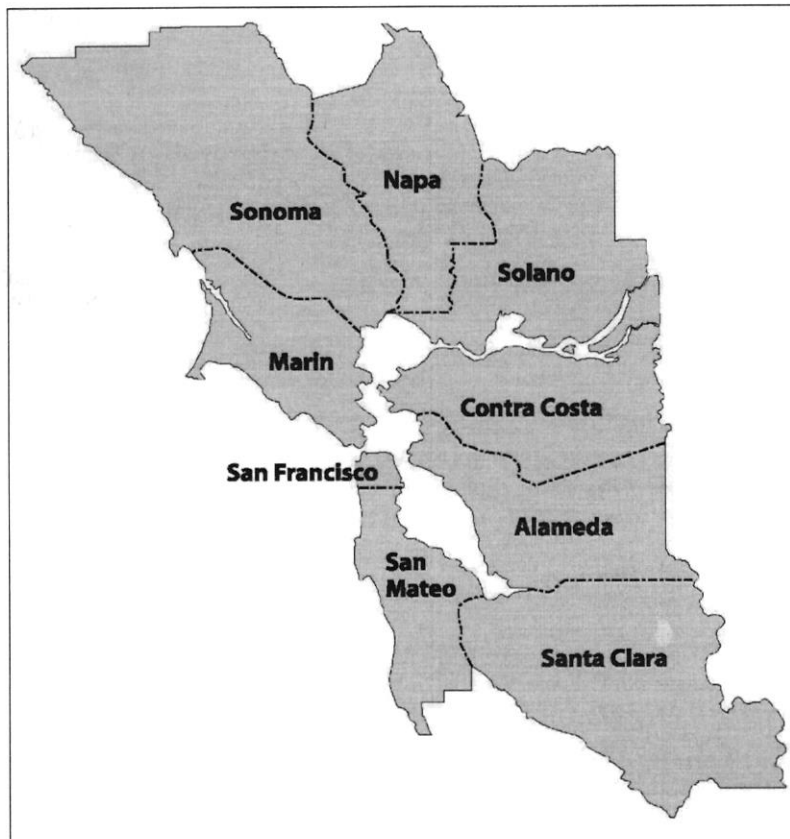
FIGURE 1. NINE-COUNTY SAN FRANCISCO BAY AREA

Adoption and implementation of Plan Bay Area 2050+ has the potential to result in environmental effects in all the environmental impact areas identified in CEQA. For this reason, the Plan Bay Area 2050+ EIR will be a “full scope” document and will analyze all the required CEQA environmental issue areas. These include: aesthetics; agriculture and forestry resources; air quality; biological resources; cultural resources; energy; geology and soils; greenhouse gas emissions; hazards and hazardous materials; hydrology and water quality; land use and planning; mineral resources; noise; population and housing; public services; recreation; transportation/traffic; tribal cultural resources; utilities and other service systems; and wildfire. The EIR will also address cumulative effects, growth inducing impacts and other issues required by CEQA.