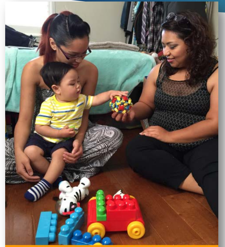
"It's great how we get to discuss a wide range of topics, such as goal setting, family planning and learning about my baby's milestones."