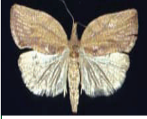
The detection of a second Light Brown

Apple Moth (LBAM) in Davis on May 14 has invoked a state interior quarantine around the City of Davis, extending into a small portion of Solano County. The county is already under a federal quarantine that regulates the shipment of products and material from the county to other states, due to the LBAM presence in the Vallejo/Benicia area. The first Davis LBAM detection was discovered in early April.