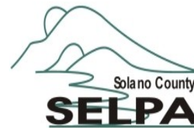
Solano County Office of Education

Partnership for Early Access for Kids ~ Solano