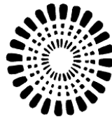
Youth and Family Svcs