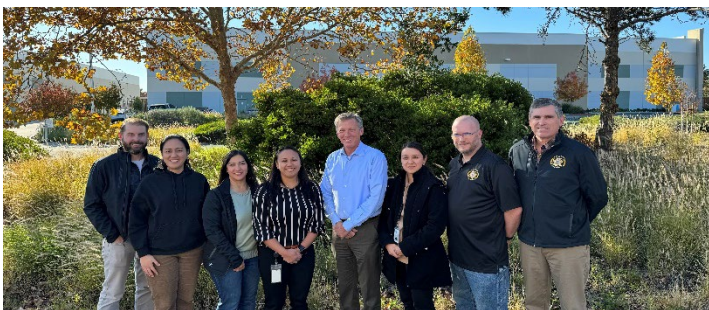
BUREAU OF FORENSIC SERVICES LABORATORY TEAM